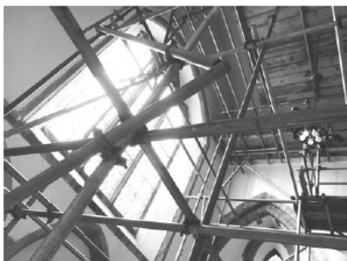
above: scaffolding up in early 2022 for repairs to the ceiling

St Mary's "Tea and Cake" community café is open 2pm-4pm on Tuesday afternoons during term-time. Everyone welcome to drop in for fresh tea and homemade cake (no prices - donations only). It's a great space to meet friends (or make new friends, or come on your own for some quiet...) to stop off on a walk, to bring children to play, or to explore the building.